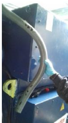
Close-up of the holes in the flexible tube where it was in contact with the metal guide.