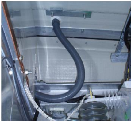
Close-up of the flexible tube inside the transformer enclosure through which the environmental sensor wiring passes.

The process in cases of the cable disappearing down the tube consists of recovering the cable from inside the nacelle by passing a guide through the tube from outside down to the nacelle, tie the cable to the guide and then pull the guide from outside.