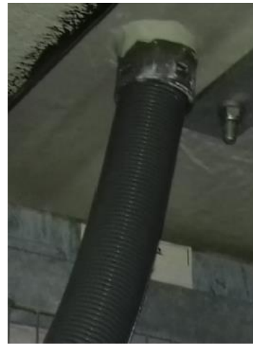
Close-up of the upper flexible tube fastening inside the transformer enclosure.

The following day, the two maintenance technicians returned to the turbine with a metal cable-passing guide, but it was theirs and did not belong to the company. Since metal guides are not as flexible as nylon ones, they believed it would make the job easier to carry out.