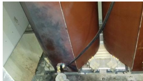
Close-up of inside the transformer where the short-circuit probably occurred.